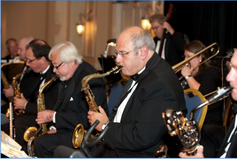
Listen to that Big Band music!