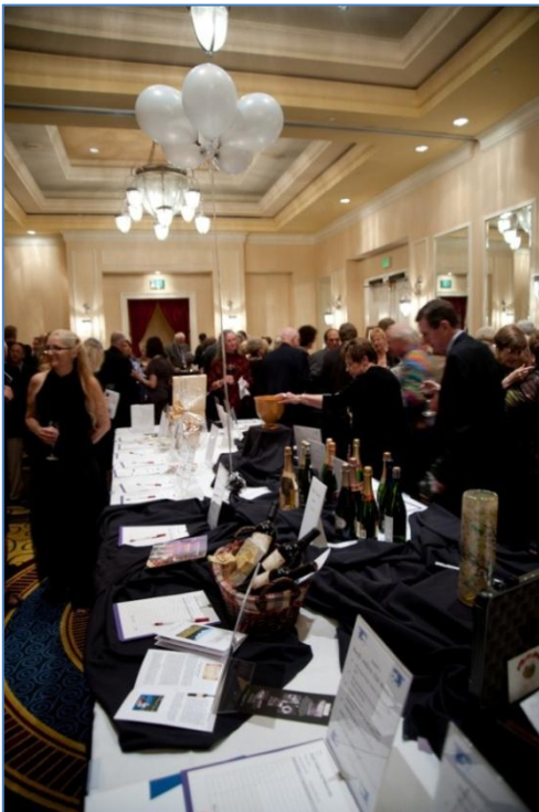
The silent auction room