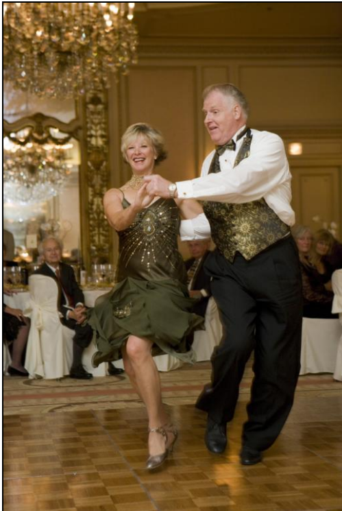
Show 'em how to do it!