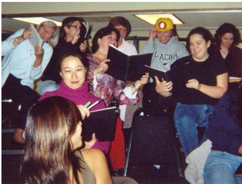
Lighting the way

This brings me to my next point. I'm now the one bearing the costs for printing the paper copies of Tutti. For at least the last year, the paper copies have really been meant for those who couldn't receive Tutti by e-mail, or don't have the means to view and/or print it. Up until the last issue, the paper copies have been printed at the University on University equipment. Since that is no longer the case, I hope you will help reduce my costs by only taking a paper copy if you really need one. If it's a matter of not having a reader for the PDF file, you can download one for free from http://www.adobe.com/products/acrobat/