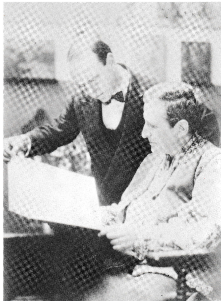
Virgil Thomson and Gertrude Stein, 1929

but she is remembered primarily for her work on behalf of women's causes, not just suffrage but also equal pay and educational opportunities for women. Her efforts on behalf of suffrage led to her arrest and trial in New York in 1872 and to achieving the right to vote for women in Wyoming in 1890, but she did not live to see the enactment of the Nineteenth Amendment, which took place a century after her birth.