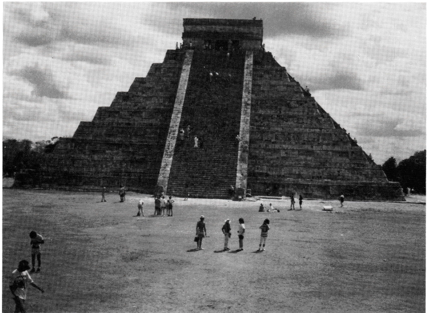
The Castillo, or pyramid of Kukulkan, centerpiece of the Chichen Itza ruins, Yucatan, Mexico.