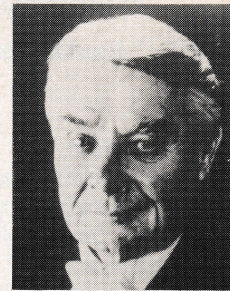
Robert Shaw, conductor

Friday's performance is sponsored by Bank of Southern California Saturday's performance is sponsored by Creaser Price Insurance Agency, Inc.